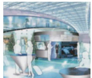
People friendly (2)

For further information, please contact :