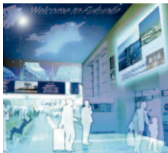
People friendly (1)